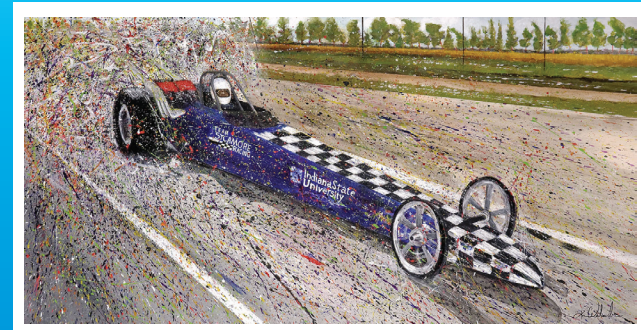
Kim Watanabe, Full Throttle Education , 2009, 24 x 48 inches, Acrylic on Canvas