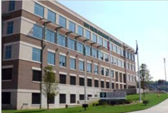
Ivy Tech Community College - Lawrenceburg

Post-secondary education is thriving in the southeast corner of Indiana. Ivy Tech's changes are immense: a new building opened in Lawrenceburg this fall and construction is well under way for the new Madison facility.