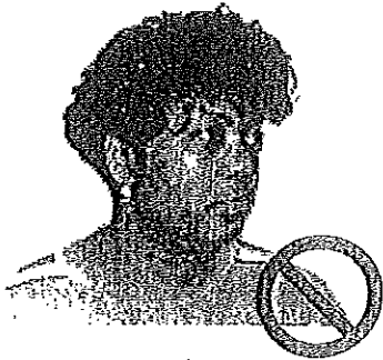
Old Three-Quarter Style Photo