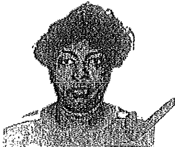
New Passport Style Photo