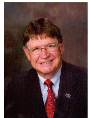
State Representative Clyde Kersey