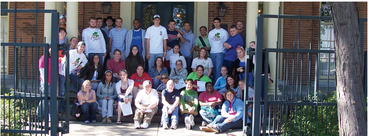
The students who went on the 2006 Hull House Service Learning Trip pose in front of the Hull House Museum on the University of Illinois-Chicago campus.