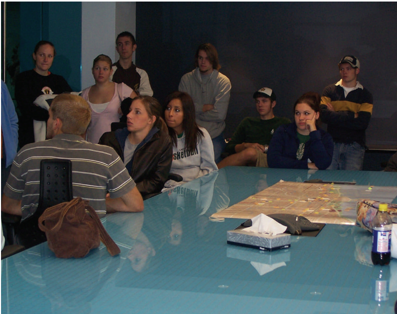
Students on the 2006 Hull House Service Learning Trip listen as they are given instructions on checking packets for the Chicago Marathon. The Chicago Marathon provides money to Hull House, one of its preferred charities. Students on the trip helped with the Marathon, which helped Hull House.

A full quarter of those in attendance were Political Science/Legal Studies Learning Community students.