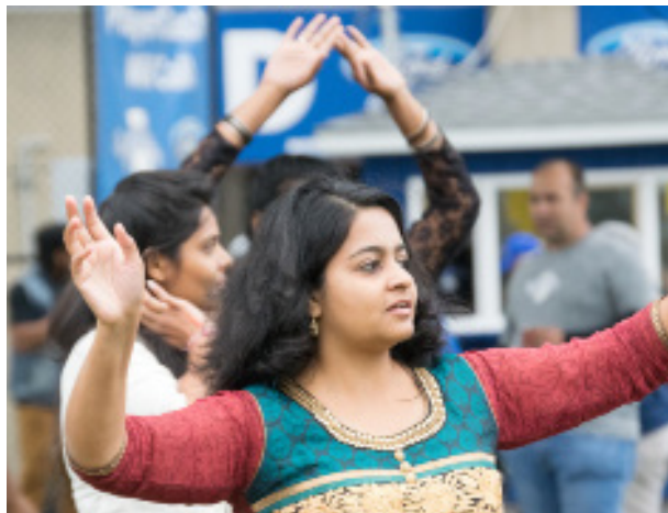
Students perform traditional dances at homecoming.

Wise Pies 2961 S. 3rd Street Terre Haute, Indiana 812-814-4280