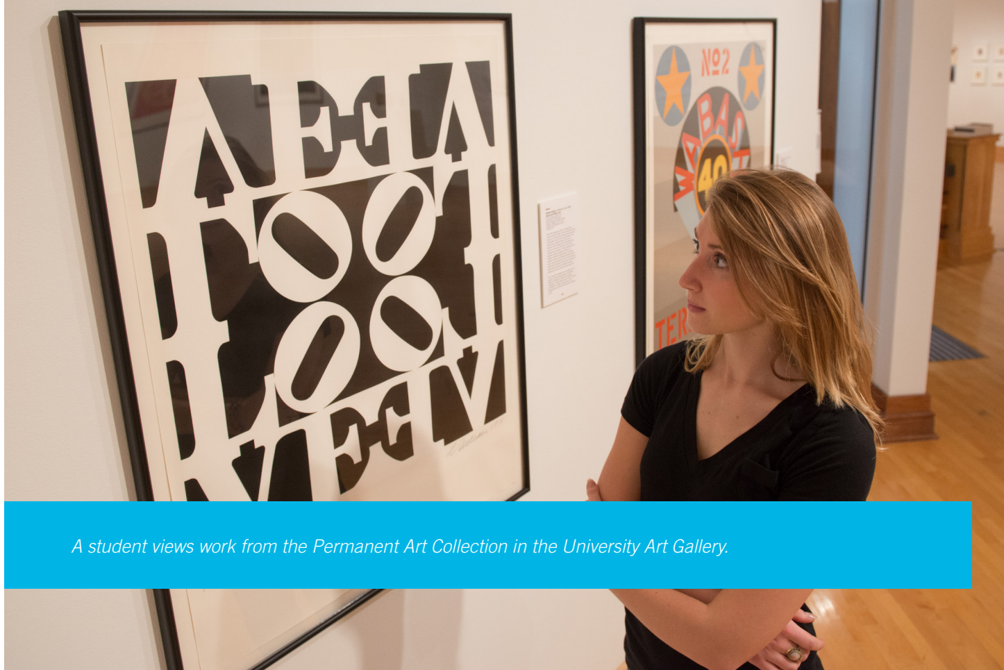
A student views work from the Permanent Art Collection in the University Art Gallery.