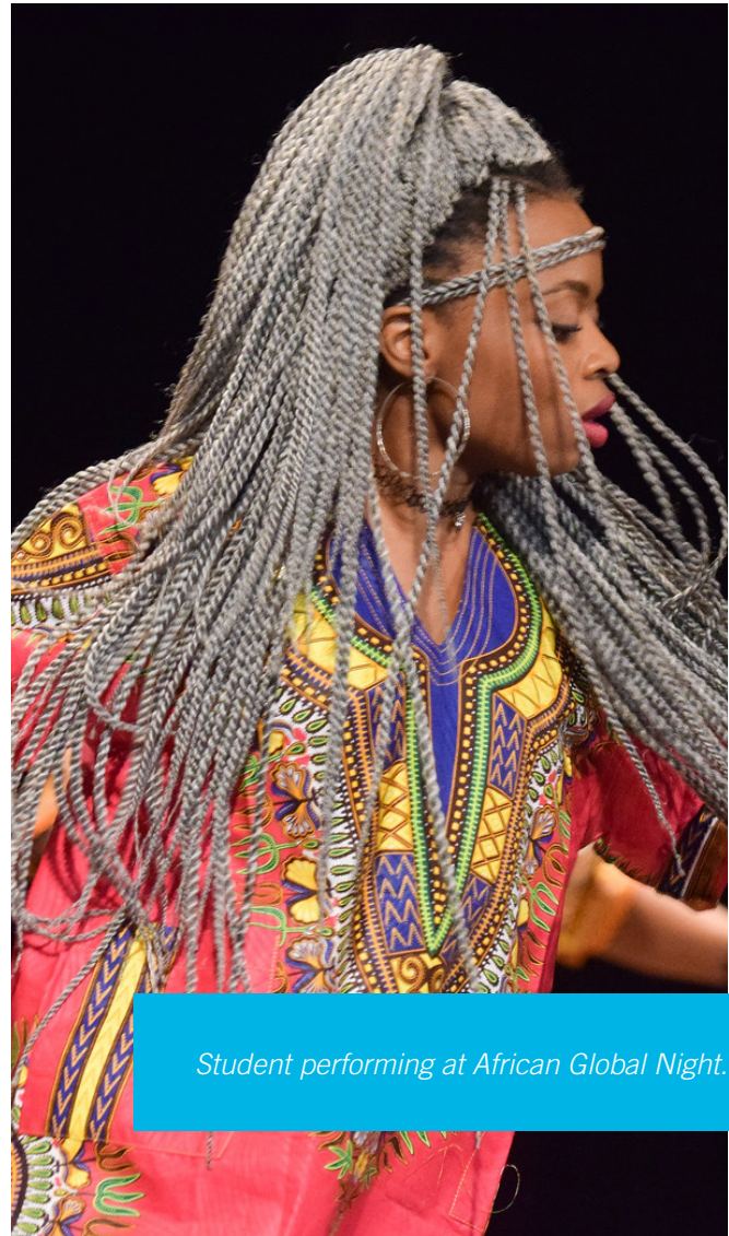
Student performing at African Global Night.

Sisters of Providence - Church of the Immaculate Conception 1 Sisters of Providence-Owens Hall St. Mary-of-the-Woods, Indiana 47876 812-535-3131