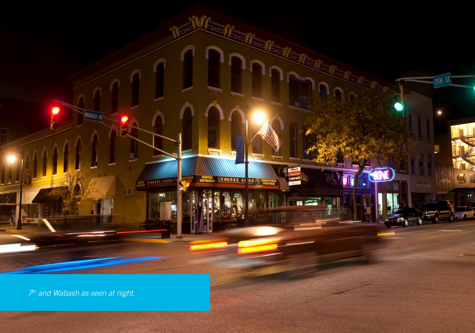
7 th and Wabash as seen at night.