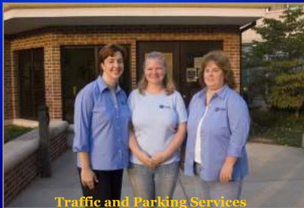
Traffic and Parking Services