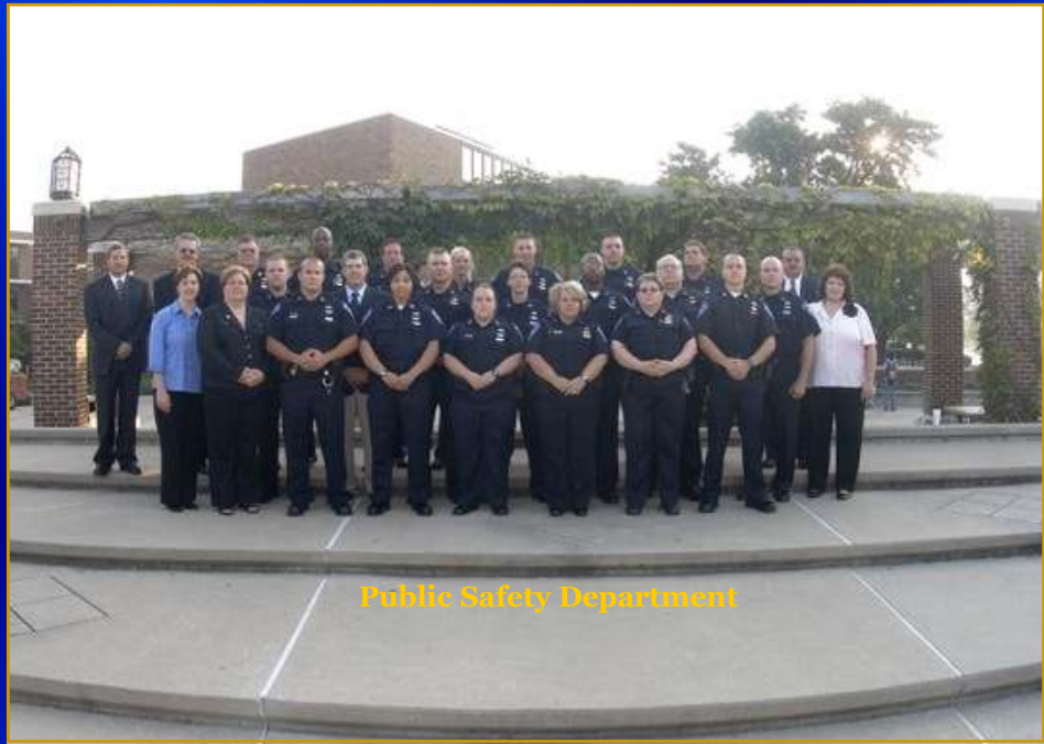
Public Safety Department