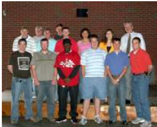
2005-06 Community Service Officers