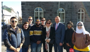
Photo: Students meet the President of Iceland, Guðni Th. Jóhannesson, and his wife during Reykjavik tour.

A group of MBA students visited Reykjavik, Iceland in July 2019 to learn and experience aspects of Iceland's sustainable entrepreneurship / circular economy.