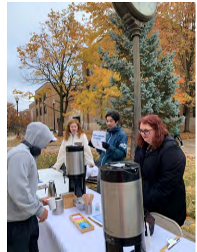
Above: Student stopping by our Languages and Lattes table for a drink and a chat with our faculty and grad students

Sycamore Sam with his multilingual salutations was once again at the center of the melee to welcome students, families, and alumni as they made their journey to the stadium for the big game. Visitors could stop by to answer different language and linguistic questions for a chance at throwing water at their choice of LLL faculty or graduate assistant.