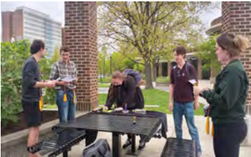
Eta Sigma Phi Initiation Spring 2022