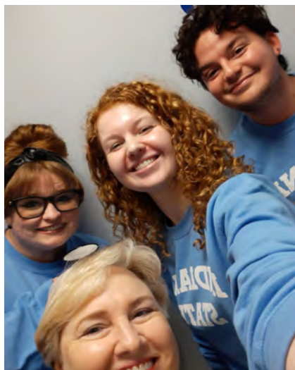
The LLL group Smarticus was crowned the CGPS Trivia Night winner in November 2022