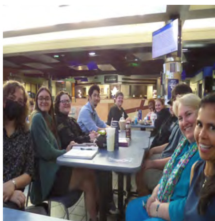
Monthly Dinner Night with Lingua Franca House and LLL department members

Lingua Franca House is a student organization, established in 2019, for all students interested in learning French, German, Japanese, Latin, Spanish, or Linguistics. Lingua Franca House provides an immersive living learning community within the residential halls.