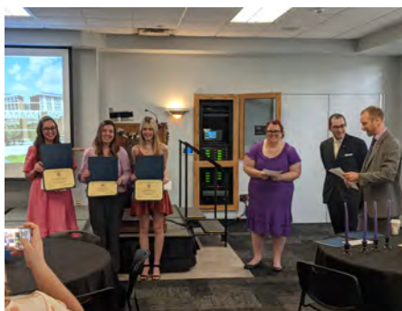
Left: 2022 Honors Day initiation ceremony