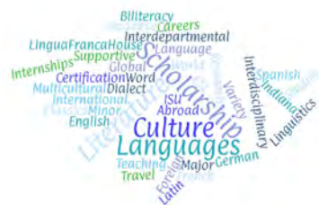
Left: New department word cloud debuted on our website in August 2022