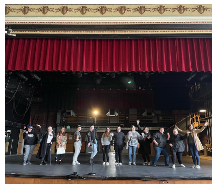
Above: Students and faculty striking a pose on a cultural field trip in Indianapolis