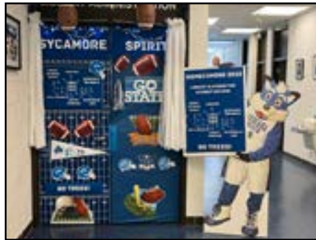
Cunningham Memorial Library picture above; Early Childhood Education Center picture to the right

Congratulations to both of the winning departments!